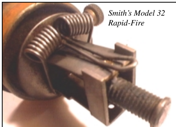
Smith's Model 32 Rapid-Fire

If you have the type of spring system shown below, you must glue the flint into the tube with about 1/8" extending, or crimp the tube in slightly so the flint is a friction fit. Push the flint through so that it extends 1/16" to 1/8". Check flint extension often and make sure you are not consuming the brass tube.